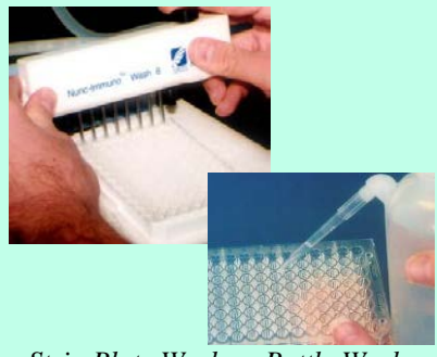
Strip Plate Wash or Bottle Wash