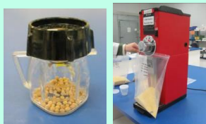
Choose grinding method

For other sampling scenarios or different screening or confidence levels, refer to the USDA/GIPSA Excel spreadsheet described under Step 1 above, or call EnviroLogix Technical Support for assistance.