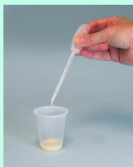
Transfer extract to cup, about 3 pipettefuls