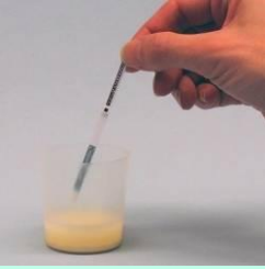
After 30 seconds, add QuickStix to cup