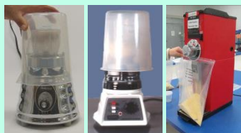
Choose grinding method