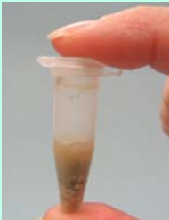
Extract Seed Sample