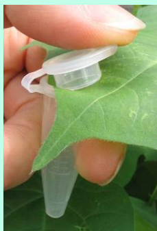
Obtain Leaf Tissue

Contact EnviroLogix to order bulk-packaged kits. Bulk kits include EB2 Extraction Buffer Concentrate. To prepare 1 liter, mix 50 mL 20x Concentrate with 950 mL of distilled or deionized water. Store refrigerated when not in use; allow to come to room temperature before using.