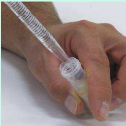
Add buffer, cap and shake