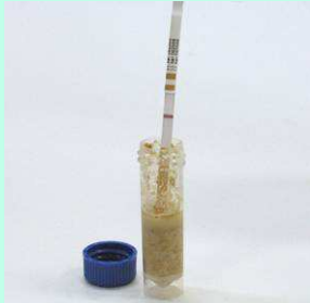
Place strip in extraction vial