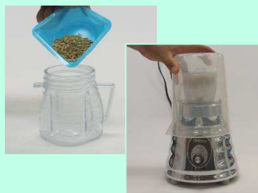
Weigh, grind seeds

* Available through EnviroLogix as accessory items; see list on page 3