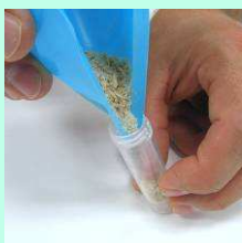
Transfer crushed seeds to vial