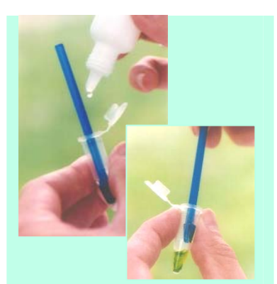
Add buffer, grind again