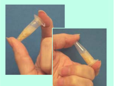
Extract seed sample vigorous shaking is vital