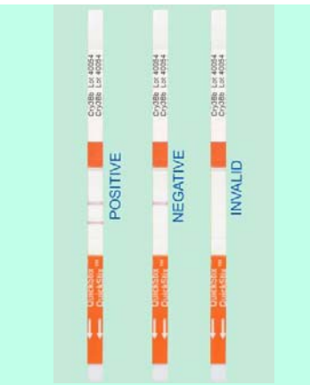
Any clearly discernable pink Test Line is considered positive