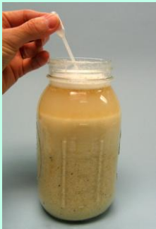
Avoid pulling up particles when drawing sample