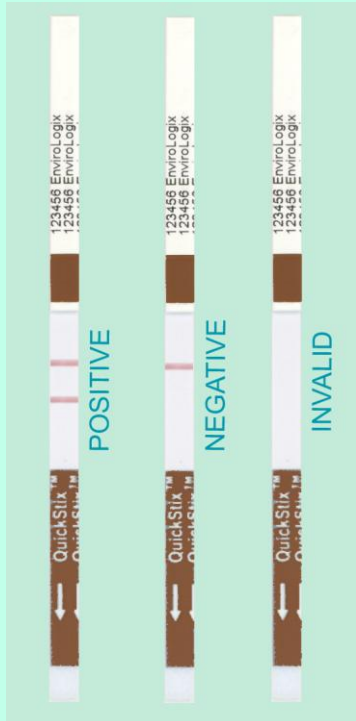
Any clearly discernable pink Test Line is considered positive