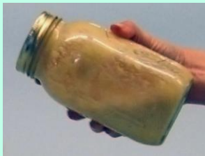
Shake, wetting entire sample