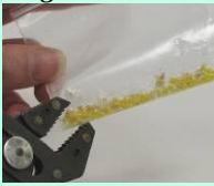
Crush single seed