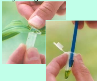
Obtain leaf tissue, grind