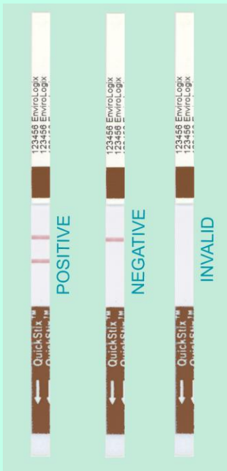
Any clearly discernable pink Test Line is considered positive

well mixed. Allow the solid material to settle to the bottom of the tube. The extract takes on a yellow opaque color when the samples are prepared properly.