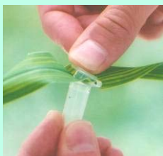
Obtain Leaf Tissue

Contact EnviroLogix to order bulk-packaged kits. Bulk kits include EB2 Extraction Buffer Concentrate. To prepare 1 liter, mix 50 mL 20X Concentrate with 950 mL of distilled or deionized water. See buffer bottle label for storage conditions.