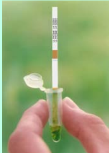
Insert QuickStix Strip