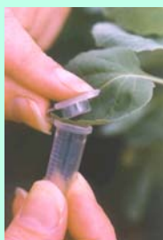
Obtain Leaf Tissue

Contact EnviroLogix to order bulk-packaged kits. Bulk kits can be purchased with or without Tissue Extractors, and include EB2 Extraction Buffer Concentrate. To prepare 1 liter, mix 50 mL 20X Concentrate with 950 mL of distilled or deionized water. Store refrigerated when not in use; allow to come to room temperature before using.