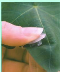
Obtain Leaf Tissue

Contact EnviroLogix to order bulk-packaged kits. Bulk kits include EB2 Extraction Buffer Concentrate. To prepare 1 liter, mix 50 mL 20X Concentrate with 950 mL of distilled or deionized water. Store refrigerated when not in use; allow to come to room temperature before using.