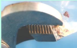
Crush single seed