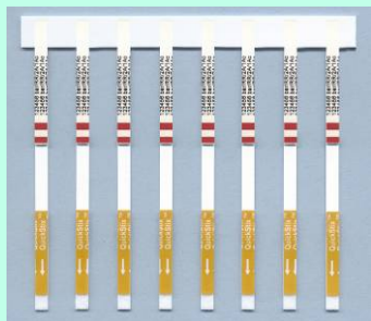
Remove QuickStix Combs