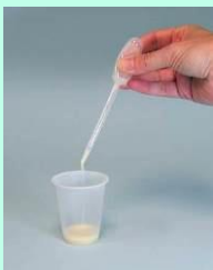
Transfer extract to cup, about 3 pipettefuls