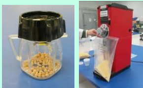
Choose grinding method