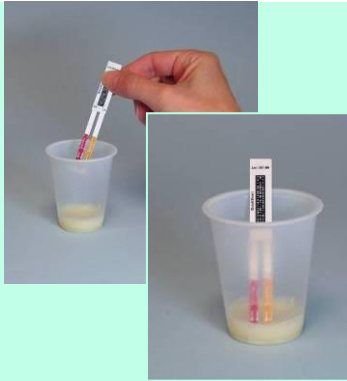
Place QuickComb in cup