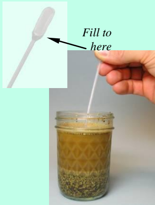
Avoid pulling up particles when drawing sample