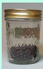
Weigh sample into jar