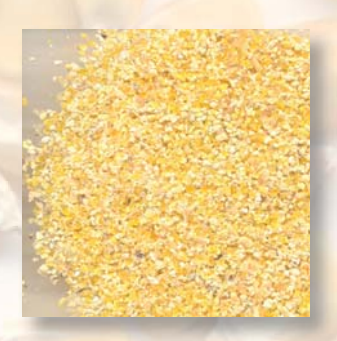
Ground too coarse = improper extraction