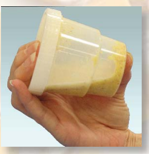
3. Shake 1 minute on mechanical shaker or by hand for 1½ minutes