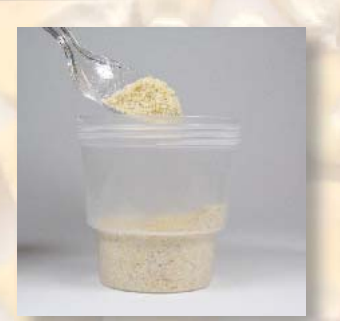
1. Add 10-50 gram subsample to container