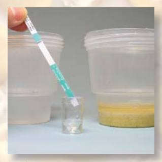
6. Stir well with pipette and add test strip, wait 5 minutes for results