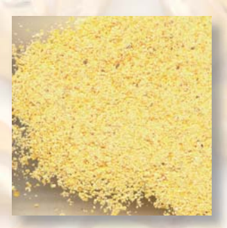
1.Collect and grind a representative corn sample to a 20 mesh screen size