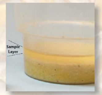
4. Allow to settle into two layers - top layer is where sample is taken