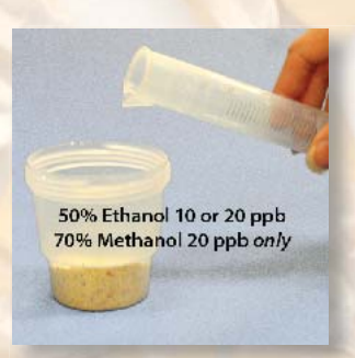
2. Add 2 mL/gram of solvent (example: 20 mL for 10 gram sample)