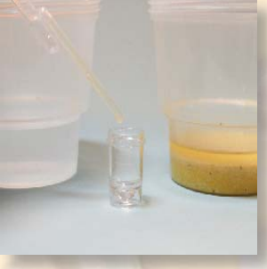
5. Add one pipette of tap water to vial first, then one from sample