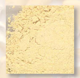
Ground too fine = sample may not flow