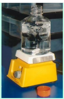
Prepare wash buffer and extraction solutions