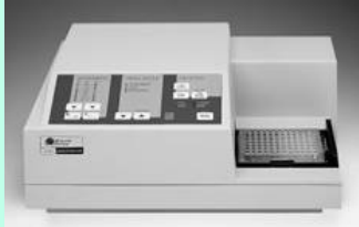
Read plates in a Plate Reader within 30 minutes of the addition of Stop Solution