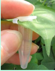
Obtain Samples, Extract