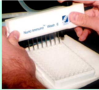
Plate Wash option