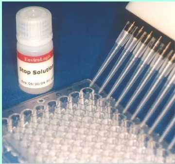
Complete protocol and add Stop Solution