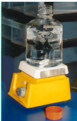
Prepare Wash /Extraction buffer

Stop Solution: 1 N Hydrochloric acid (HCl). Prepare by adding 83 mL of concentrated HCl (36.5-38.0%) to 917 mL of distilled or deionized water; work in a fume hood and use proper protective gear. This reagent may be stored at room temperature for 2 years.