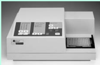
Read plates in a Plate Reader within 30 minutes of the addition of Stop Solution

wells completely with Wash/Extraction Buffer, then shake to empty. Repeat this wash step three times. Alternatively, perform these four washes (300 \mu L/well) with a microtiter plate or strip washer. Slap the inverted plate on a paper towel to remove as much liquid as possible.