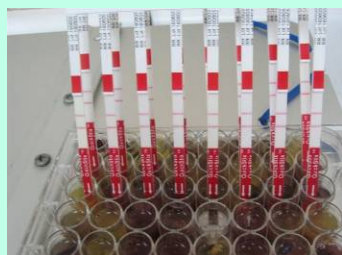
Place combs in plate