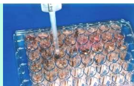
Add Extraction Buffer