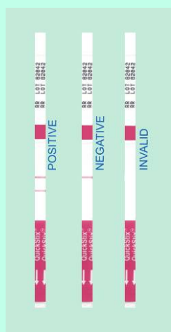
Any clearly discernable pink Test Line is considered positive